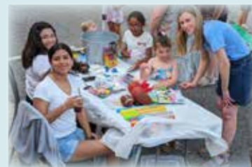
Kids activities at Durham event

Check ncbegin.org frequently for details.